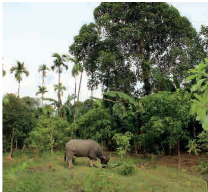
Keeping livestock, as in this home garden in Vietnam, can provide animal protein to families that could not otherwise afford it.

Agricultural extension services can thus play a crucial role in helping households with home gardens, introducing them to new techniques and providing information about different species' needs (water, light, soil and nutrient requirements), how to combine and layer species for optimal results, how to introduce animals, etc. In many places, however, home gardens are not recognized as part of agricultural systems and thus are not included in outreach efforts; changing that mindset should be a policy priority. Research has also highlighted the importance of combining agricultural education and technical support with health and nutrition education. Different fruits and vegetables provide different vitamins, minerals and micro-nutrients; when households understand their nutritional