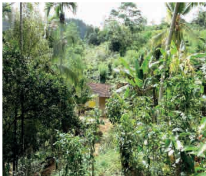
A wet-zone garden in Sri Lanka, where multi-layered edible gardens are a centuries-old tradition.

Home gardens come in many different forms, depending both on gardeners' own choices, and on external conditions: local climate, soil quality, culturally defined dietary and agricultural practices, and access to land, water, seeds, fertilizer, tools and other key resources. Many households have simple vegetable gardens with mostly annual crops, perhaps with ornamentals or trees on the margins. Others, especially in the tropics, build dense, multi-layered landscapes with trees, shrubs, vines and shade-tolerant perennials; one study in Oaxaca, Mexico, found 87% of home gardens had at least four vertical layers. 3 Gardens can also vary dramatically in terms of biodiversity: some include just a few favoured crops, while others include dozens of species, and also livestock or a small fish pond.