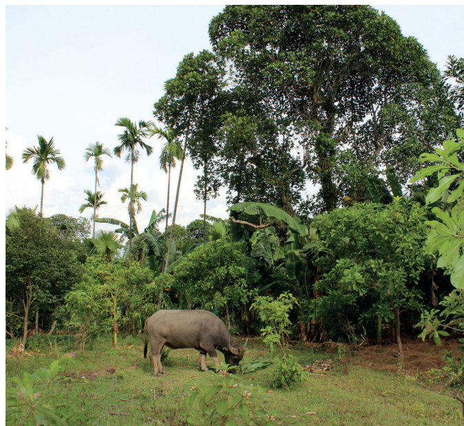
Keeping livestock, as in this home garden in Vietnam, can provide animal protein to families that could not otherwise afford it.

Agricultural extension services can thus play a crucial role in helping households with home gardens, introducing them to new techniques and providing information about different species' needs (water, light, soil and nutrient requirements), how to combine and layer species for optimal results, how to introduce animals, etc. In many places, however, home gardens are not recognized as part of agricultural systems and thus are not included in outreach efforts; changing that mindset should be a policy priority. Research has also highlighted the importance of combining agricultural education and technical support with health and nutrition education. Different fruits and vegetables provide different vitamins, minerals and micro-nutrients; when households understand their nutritional