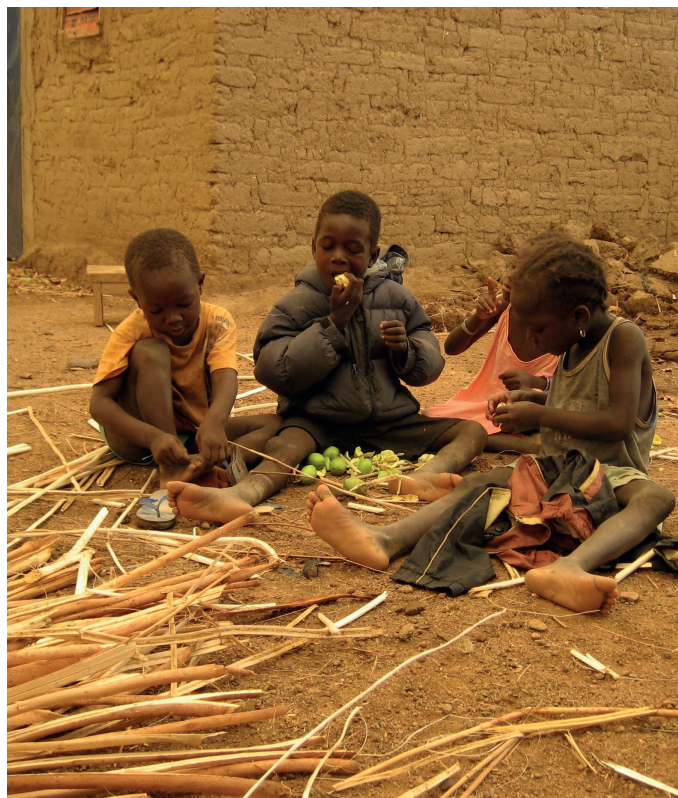
Children in the village of Bonogo, in Burkina Faso, eat green mangoes from a home garden tree.

seasonally, keeping a large number of crop, tree and animal species can help ensure a steady supply of food. Being able to harvest fuelwood in the garden has also been shown to be important, as available cooking fuels are often low-quality and increasingly scarce. 5