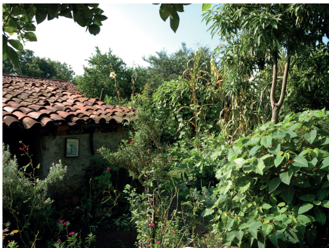
A typical patio in Jala, Nayarit, on Mexico's Pacific coast, with maize growing alongside fruit trees, herbs, chillies, and flowers.

comparative studies and literature reviews suggest that is very hard to generalize; conditions vary too much across locations. Even the well-studied subject of land tenure reform requires further research, to test the viability of different approaches and compare the pros and cons of promoting home gardens vs. community gardens, for example.