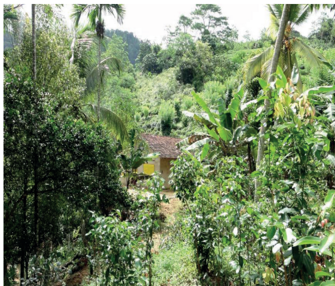
A wet-zone garden in Sri Lanka, where multi-layered edible gardens are a centuries-old tradition.

Home gardens come in many different forms, depending both on gardeners' own choices, and on external conditions: local climate, soil quality, culturally defined dietary and agricultural practices, and access to land, water, seeds, fertilizer, tools and other key resources. Many households have simple vegetable gardens with mostly annual crops, perhaps with ornamentals or trees on the margins. Others, especially in the tropics, build dense, multi-layered landscapes with trees, shrubs, vines and shade-tolerant perennials; one study in Oaxaca, Mexico, found 87% of home gardens had at least four vertical layers. 3 Gardens can also vary dramatically in terms of biodiversity: some include just a few favoured crops, while others include dozens of species, and also livestock or a small fish pond.