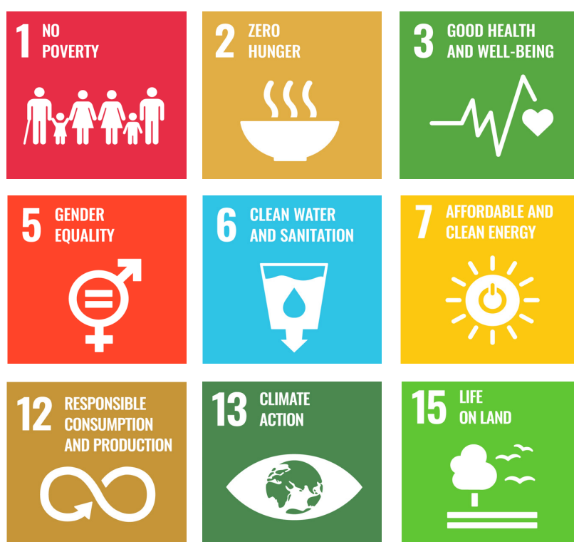
Figure 2. Agroforestry can contribute to achieving at least nine out of the 17 SDGs.

At the EAC-Level, the EAC Climate Change Policy (2011) and EAC Vision 2050 promote sustainable land use, but agroforestry implementation varies across member states. Notably, on the global level, agroforestry directly contributes to at least nine Sustainable Development Goals (SDGs) , offering a proven model for climate resilience, food security, and ecosystem restoration (See figure 2).