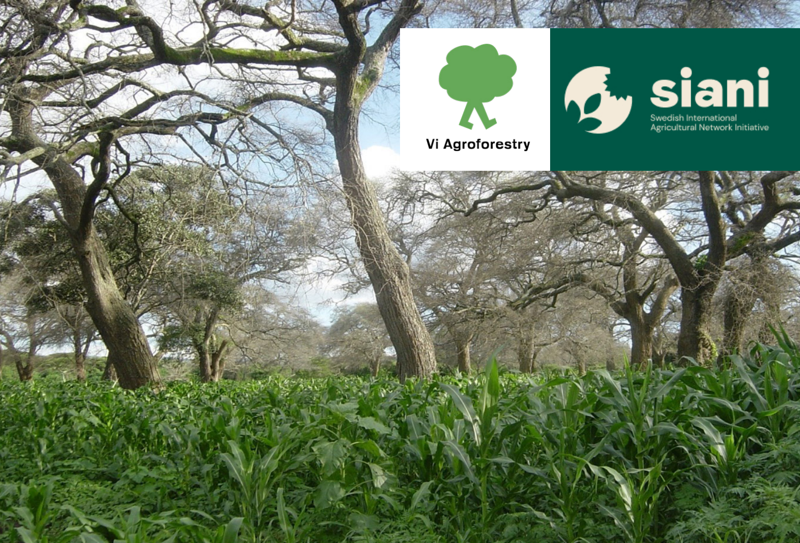
An example of agroforestry technology at work.

siani Swedish International Agricultural Network Initiative