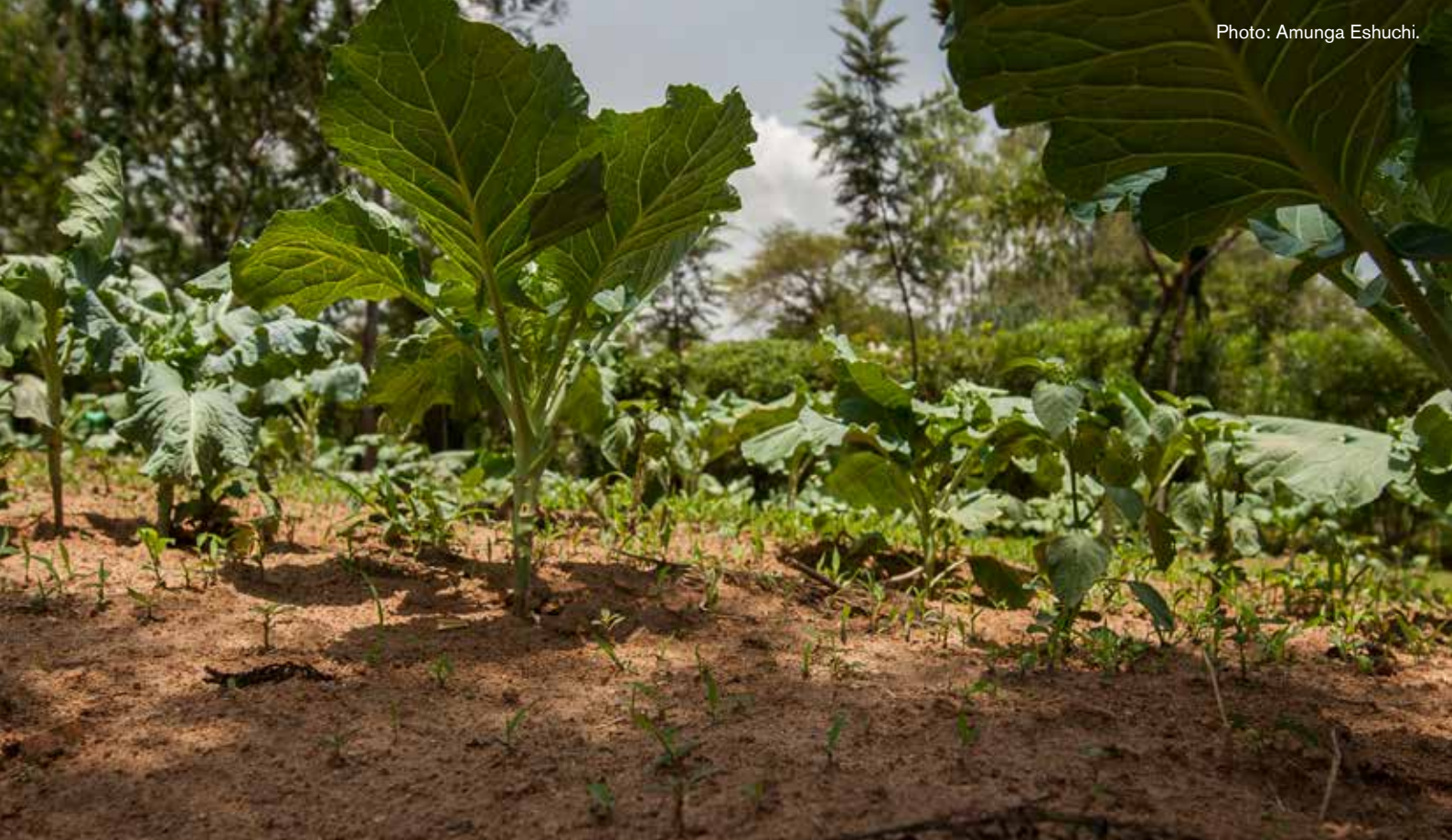
Owaro village, Kisumu, Kenya.