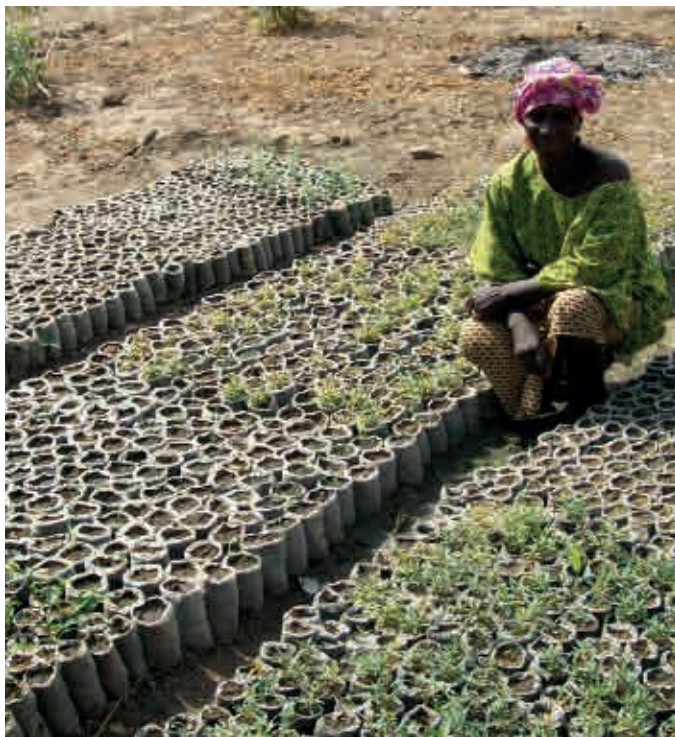
Tree seedlings in the Bendougou Nursery, in Mali, where agroforestry strategies have been widely implemented on cropland.

A more beneficial alternative, from an ecosystems perspective, is to create a multi-functional land use system. For example, native tree species can be planted together with shade-tolerant agricultural cash crops – such as coffee, cocoa or cardamom – or non-timber forest products such as rattans or medicinal plants. Such an approach also ensures economic viability and may improve biodiversity, ecosystem services and carbon capture, benefiting local communities and society as a whole. 11